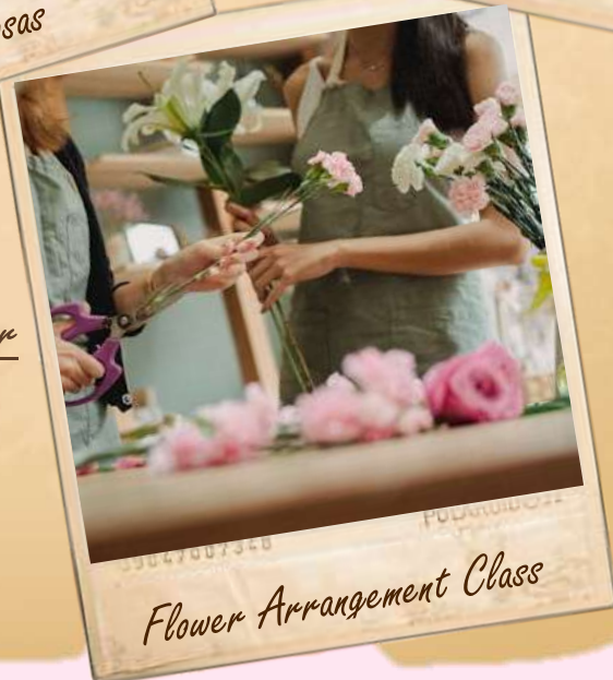
Flower Arrangement Class