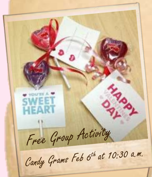
Free Group Activity