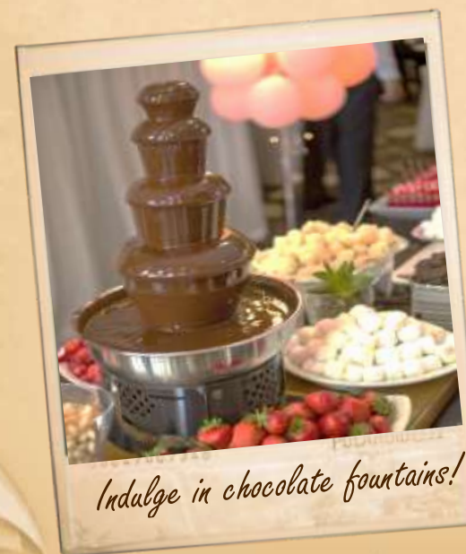
Indulge in chocolate fountains!