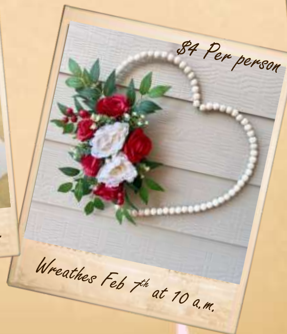
$4 Per person