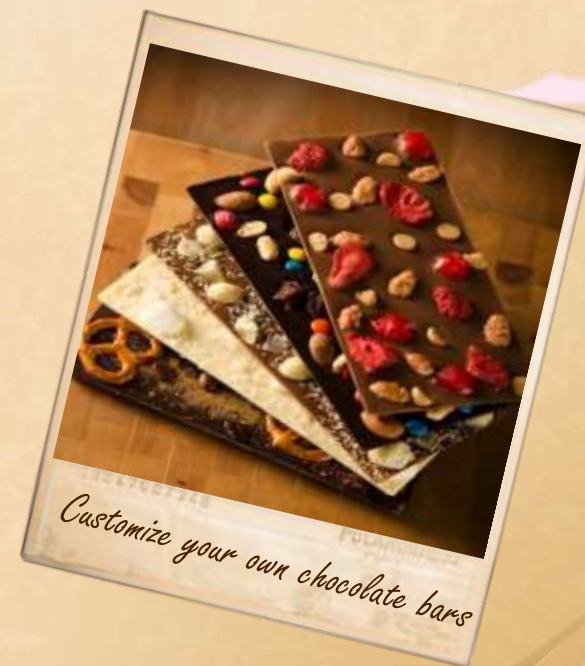
Customize your own chocolate bars