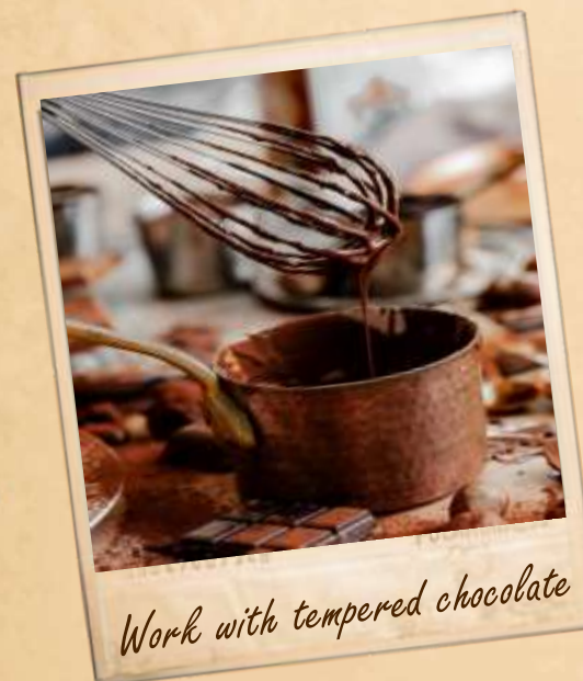
Work with tempered chocolate